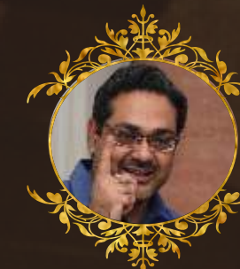
Adv. Aniruddh Mayee Supreme Court of India