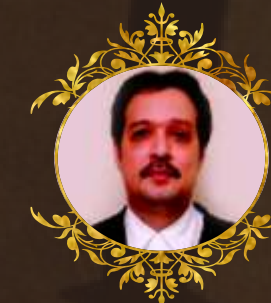
Hon'able Justice Mr. J.B. Pardiwala Justice of Gujarat High court