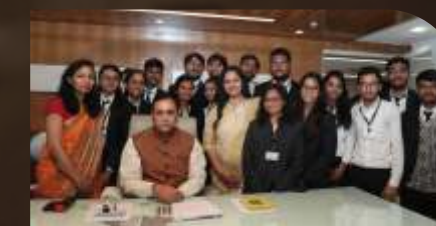
Meeting with Chief Minister