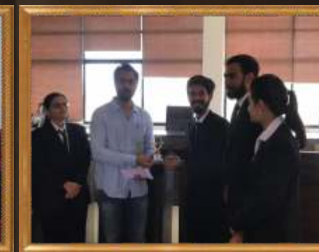
Intra Parliamentary Debate