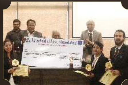
2 nd Runner up – RS.25,000/- and trophy Guru Gobind Singh Indraprastha University, Delhi