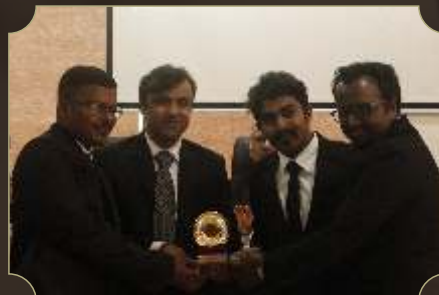
Best Memorials – RS.10,000/- and trophy The Kerala Law Academy Law College, Trivandrum