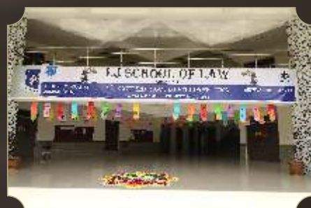
Preparations for 2 nd National Moot Court Competition