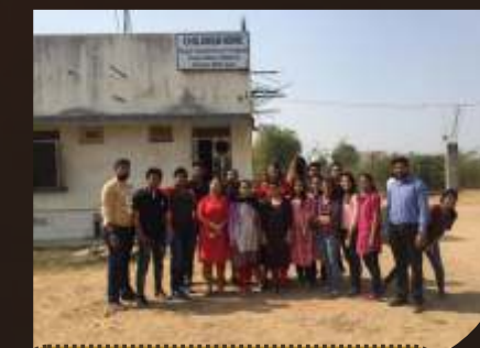
Social Visit to Children's Home.