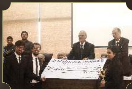
Winner – RS.1,00,000/- and trophy Government Law College – Mumbai