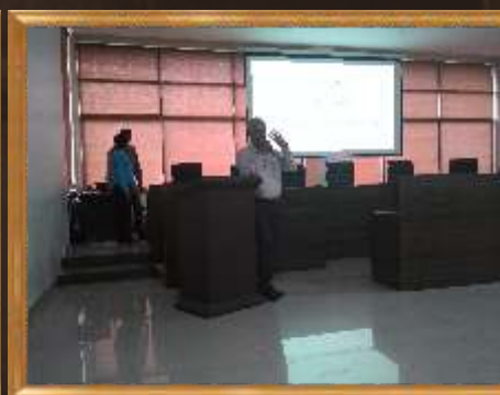
C.S. Urmil Ved on Stamp Act