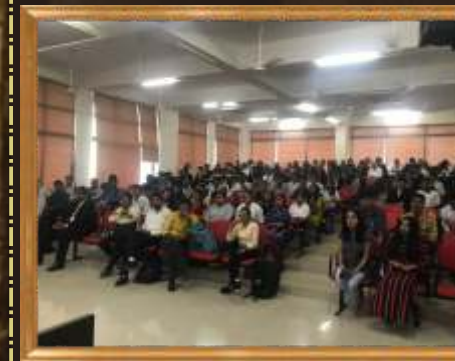
Intra Moot Court Competition