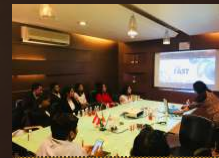
Discussion with Legal team of esteemed org.