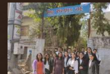
Visit to Observation Home-Khanpur, A'bad.