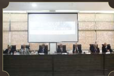
Inauguration First National Moot Court Competition