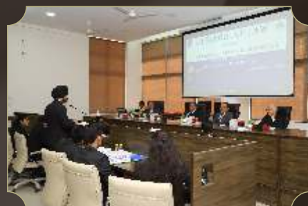
Mooting at 2 nd National Moot Court Competition