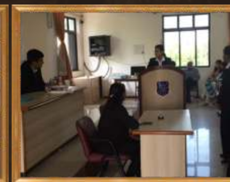
Intra Mock Trial Competition