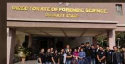
Visit to Forensic Laboratory - Gandhinagar