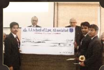
1 st runner up – RS.50,000/- and trophy National Law Institute University, Bhopal