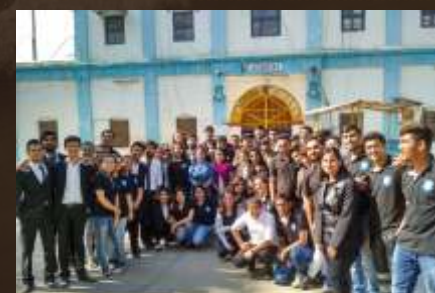
Visit to Central Jail-Sabarmati