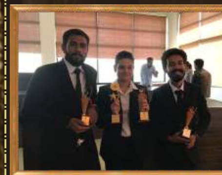
Winners of Intra Parliamentary Debate