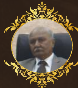
Hon'able Justice Mr. C.K. Butch Former Justice-Gujarat High court