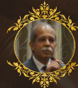
Hon'able Justice Mr. Akil Kureshi Justice of Gujarat High court