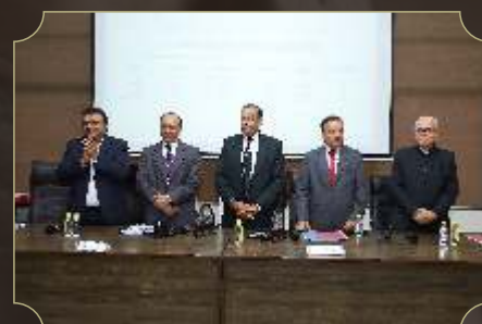
Final Round Judges of 2 nd National Moot Court Competition