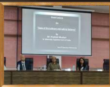
Sr. Adv. Prashant Bhushan, Supreme Court of India in a guest session on "State of the Judiciary & Judicial Reforms"