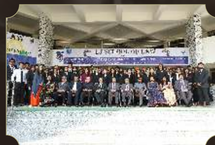
Dignitaries & Participants at 2 nd National Moot court Competition