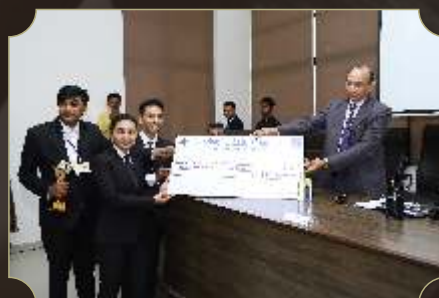
Winning Prizes worth RS. 3 Lakh