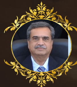
Hon'able Justice Mr. M.R. Shah, Justice of supreme court of India