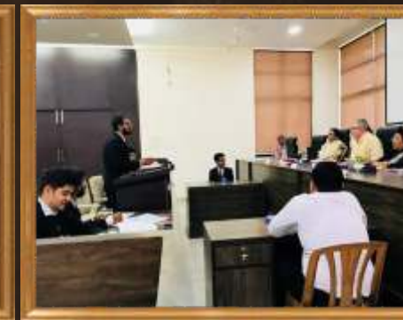
Final round Intra Moot Court Competition