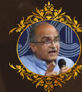
Sr. Adv. Prashant Bhushan Supreme Court of India