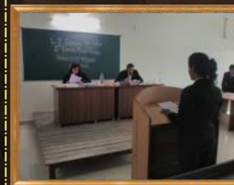
Intra Moot Court Competition