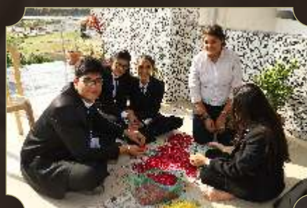
Preparations for 2 nd National Moot Court Competition