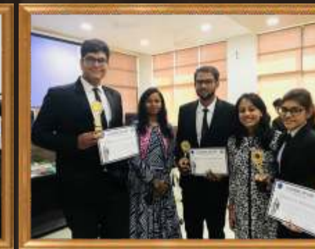
Intra Moot Court 1 st Runner Up