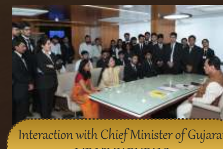
Interaction with Chief Minister of Gujarat MR. VIJAY RUPANI on Legal Policies & Frame work