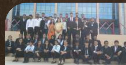
Visit to VIDHANSABHA