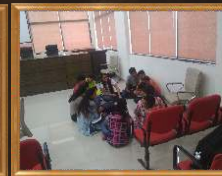
Personality development Session