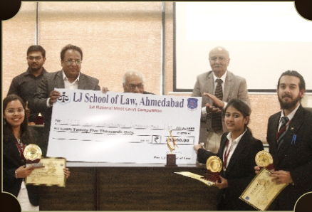
2 nd Runner up – RS.25,000/- and trophy Guru Gobind Singh Indraprastha University, Delhi