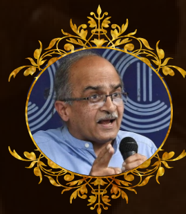
Sr. Adv. Prashant Bhushan Supreme Court of India