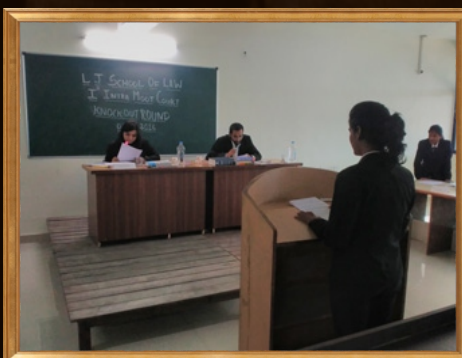
Intra Moot Court Competition