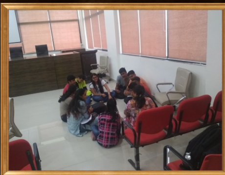
Personality development Session