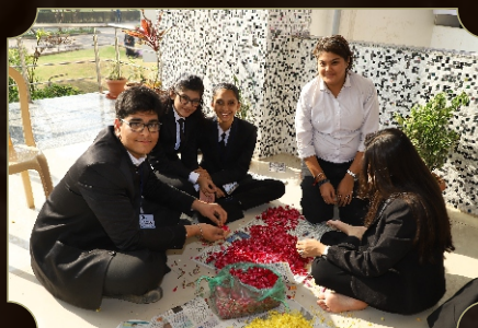
Preparations for 2 nd National Moot Court Competition