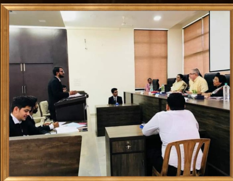
Final round Intra Moot Court Competition