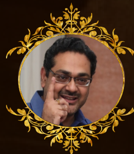
Adv. Aniruddh Mayee Supreme Court of India