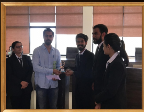
Intra Parliamentary Debate