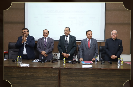
Final Round Judges of 2 nd National Moot Court Competition