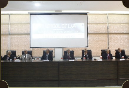
Inauguration First National Moot Court Competition