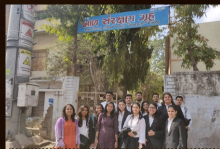
Visit to Observation Home-Khanpur, A'bad.