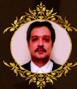
Hon'able Justice Mr. J.B. Pardiwala Justice of Gujarat High court