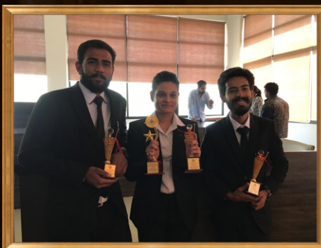
Winners of Intra Parliamentary Debate