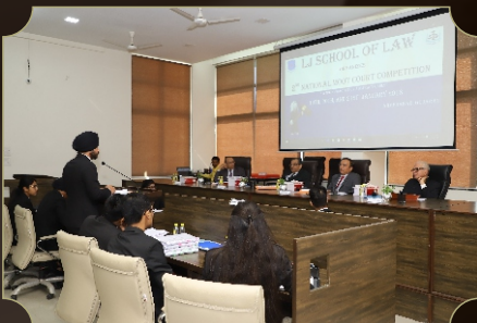
Mooting at 2 nd National Moot Court Competition