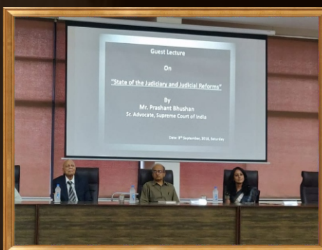
Sr. Adv. Prashant Bhushan, Supreme Court of India in a guest session on "State of the Judiciary & Judicial Reforms"