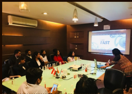
Discussion with Legal team of esteemed org.