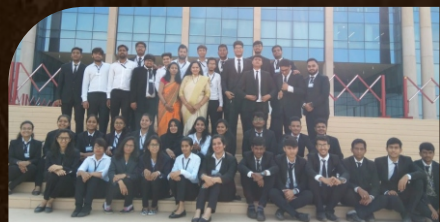
Visit to VIDHANSABHA