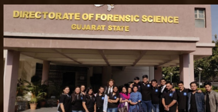
Visit to Forensic Laboratory - Gandhinagar