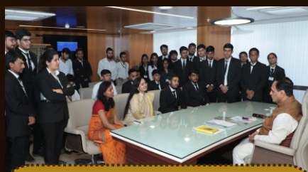
Interaction with Chief Minister of Gujarat MR.VIJAY RUPANI on Legal Policies & Frame work