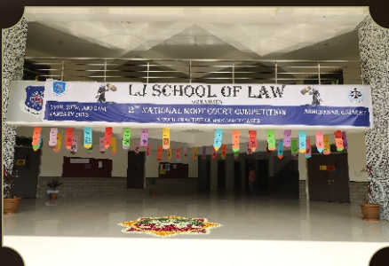
Preparations for 2 nd National Moot Court Competition