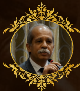
Hon'able Justice Mr. Akil Kureshi Justice of Gujarat High court