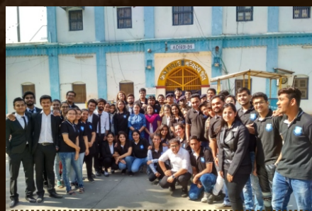
Visit to Central Jail-Sabarmati