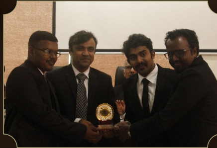
Best Memorials – RS.10,000/- and trophy The Kerala Law Academy Law College, Trivandrum