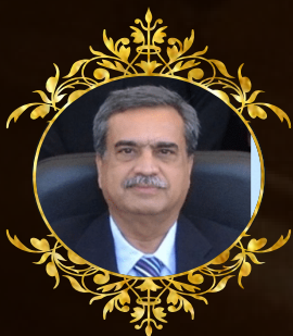
Hon'able Justice Mr. M.R. Shah, Justice of supreme court of India