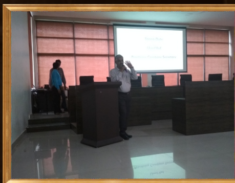
C.S. Urmil Ved on Stamp Act