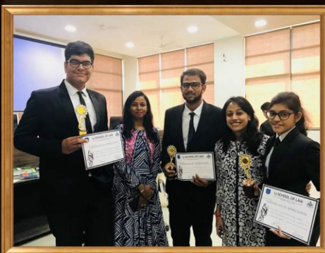
Intra Moot Court 1 st Runner Up