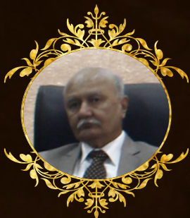
Hon'able Justice Mr. C.K. Butch Former Justice-Gujarat High court