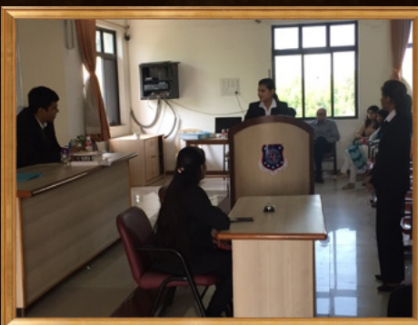
Intra Mock Trial Competition