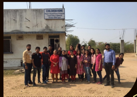
Social Visit to Children's Home.