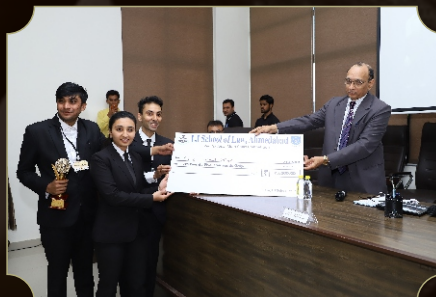
Winning Prizes worth RS. 3 Lakh