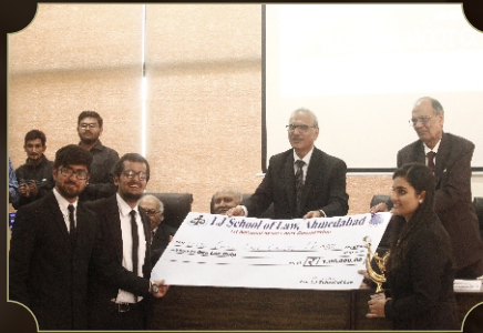
Winner – RS.1,00,000/- and trophy Government Law College – Mumbai