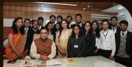
Meeting with Chief Minister