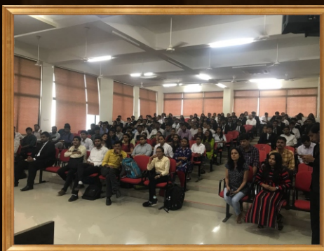
Intra Moot Court Competition