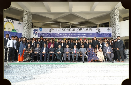
Dignitaries & Participants at 2 nd National Moot court Competition